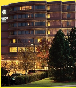
OFFICIAL CONFERENCE HOTEL DoubleTree Suites & Conference Center 2111 Butterfield Rd. - Downers Grove, IL